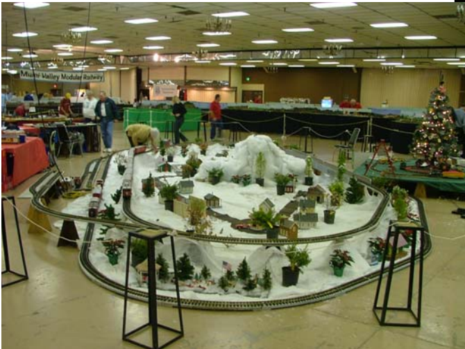
Snapshot from the Show

You are invited to the December meeting on Sunday the 19th at 2pm at the Wright Memorial Library 1776 Far Hills Oakwood, Ohio Visitors and Guests Always Welcome