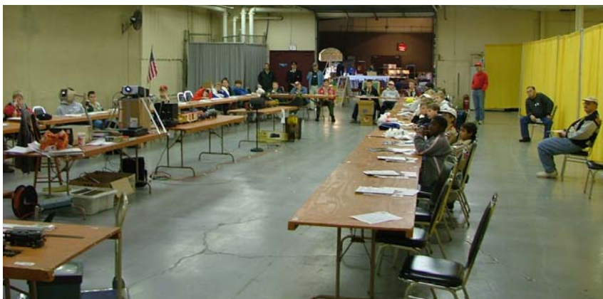
Watching a video on Saturday morning

All of this would not have been possible without the help of the following individuals and businesses: