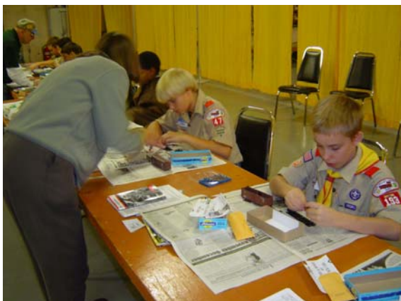
Scouts Assembling Kits