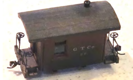
Second Place Kit Built