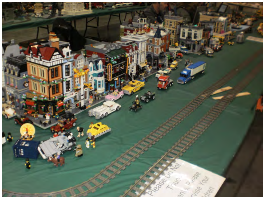
Lots and Lots of LEGOs