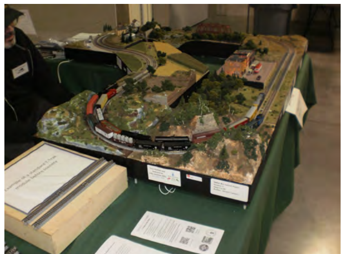
Division 3 TTrack