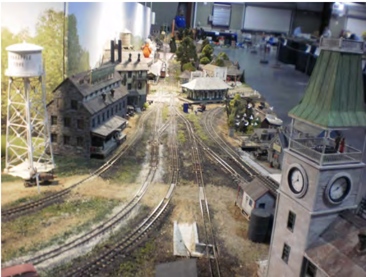
Great Lakes HO 30 Module Group