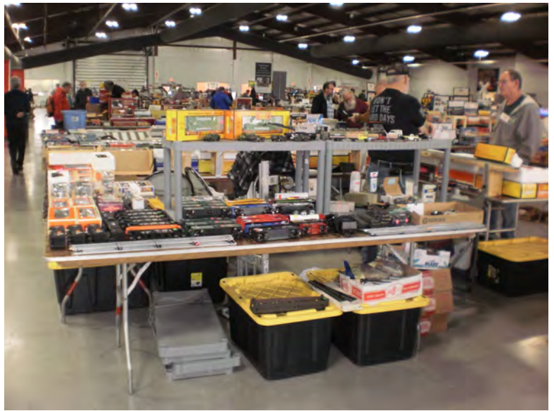
Sunday Afternoon at the Show