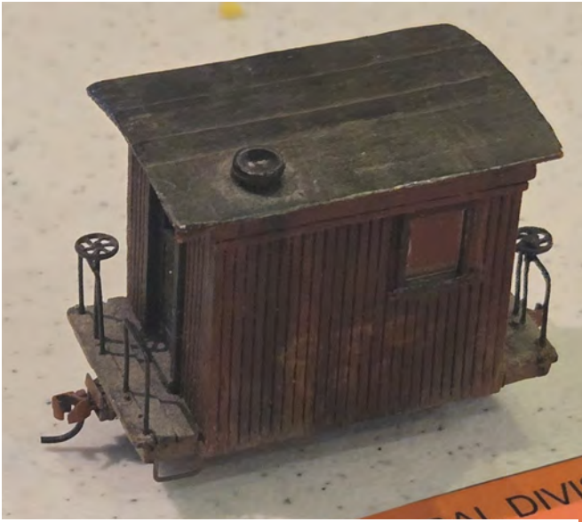
First Place Scratchbuilt