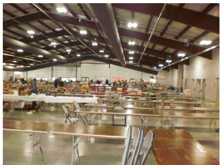
All Done Until Next Year A Hearty Well Done to Everyone