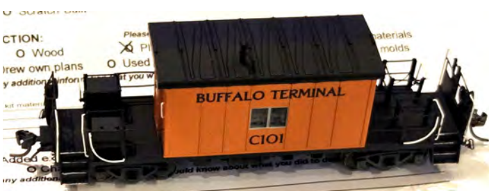
First Place Kit Built