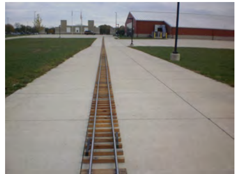
Riding the CPRSS 7 1/2" Gauge Train