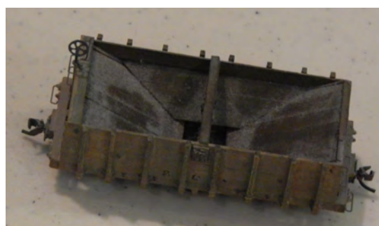
Second Place Kit