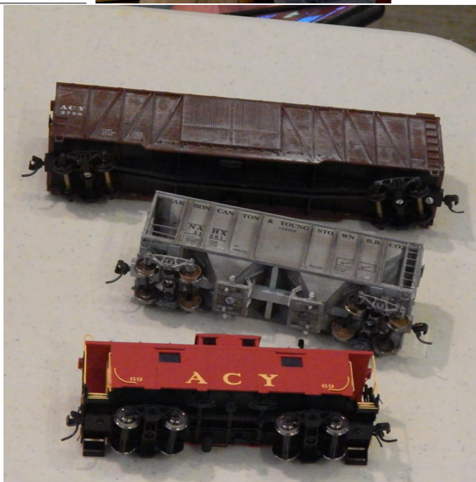
September Show and Tell by Rick Lach