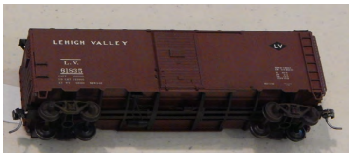
First Place Kit