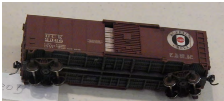
First Place Kitbash