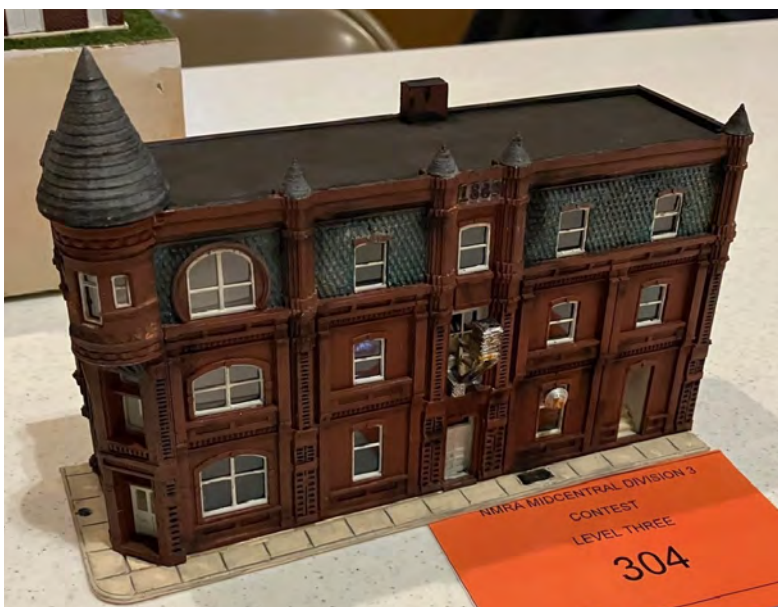
Scratch-built 2nd Eric Buck