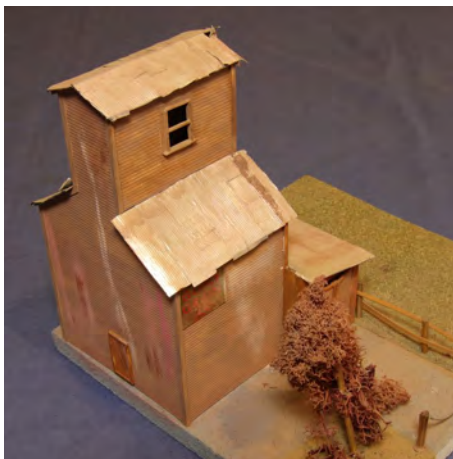
First Place—Ron Goble