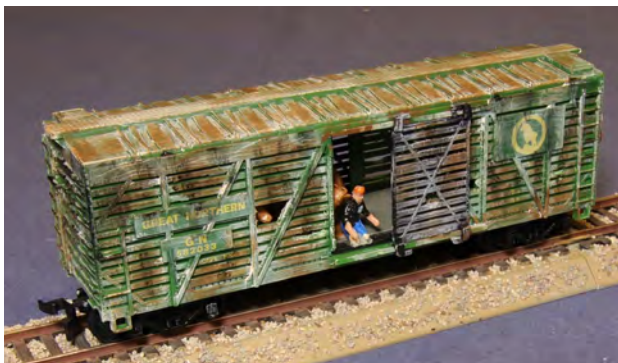
Second Place—Gail Yarnall