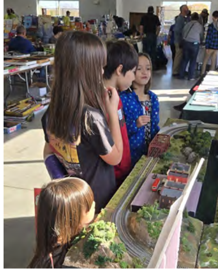
Future TTrack Modelers at Train Show

We knew going into the event that things have been tight this year. We were told that all events before us experienced some belt tightening, but our proceeds will be able to go to other events throughout 2025.