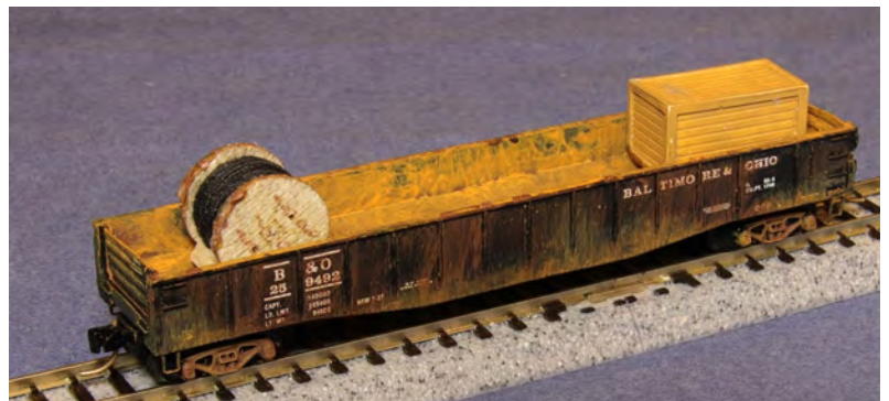
Second Place—Jack Honeycutt