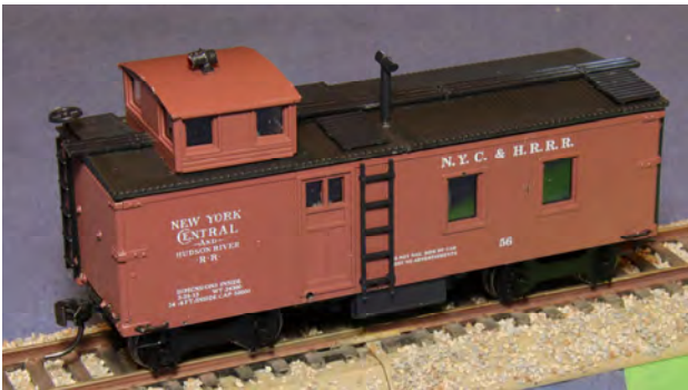
Kit 2nd — Art Mosher