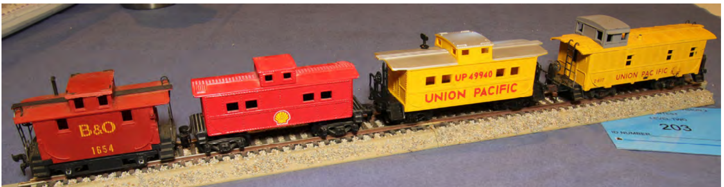
Kitbashed 3rd — Stan Sartell