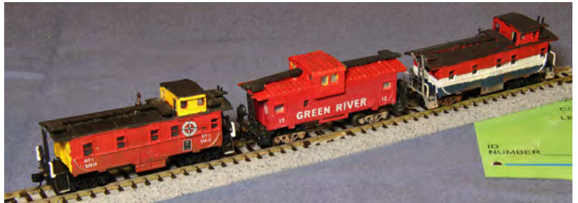
Kit 3rd — Jack Honeycutt