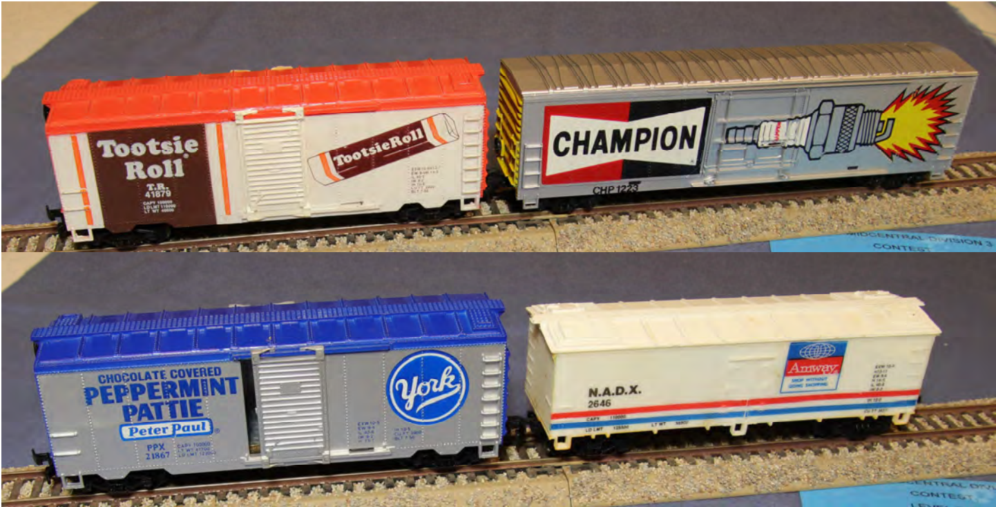
2nd Place Kit-Bashed — StanSartel