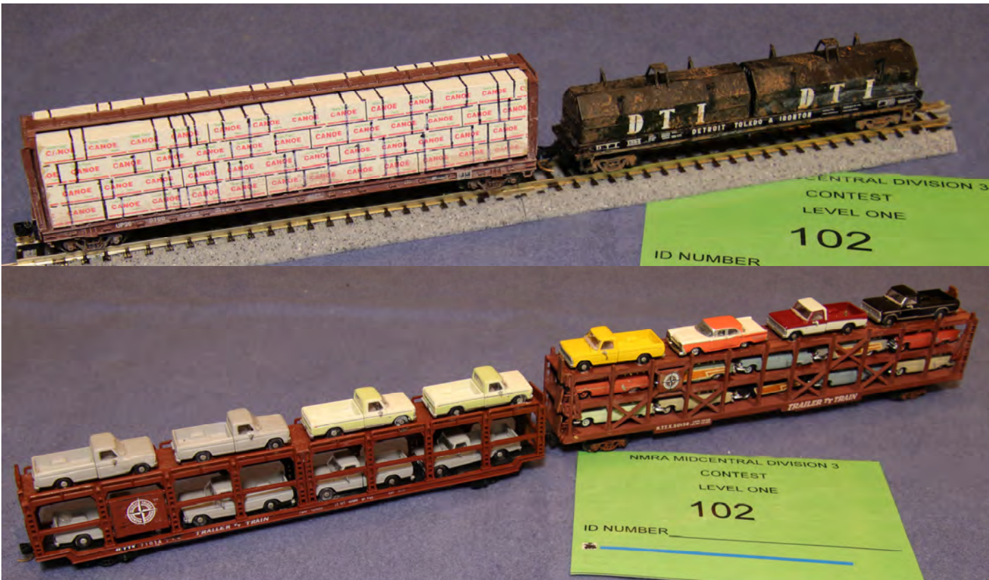
First Place Kit—Jack Honeycutt