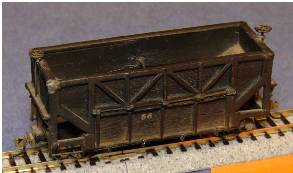
1st Place Scratch-Built — Jim Foster