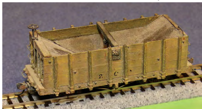
2nd Place Kit—Jim Foster