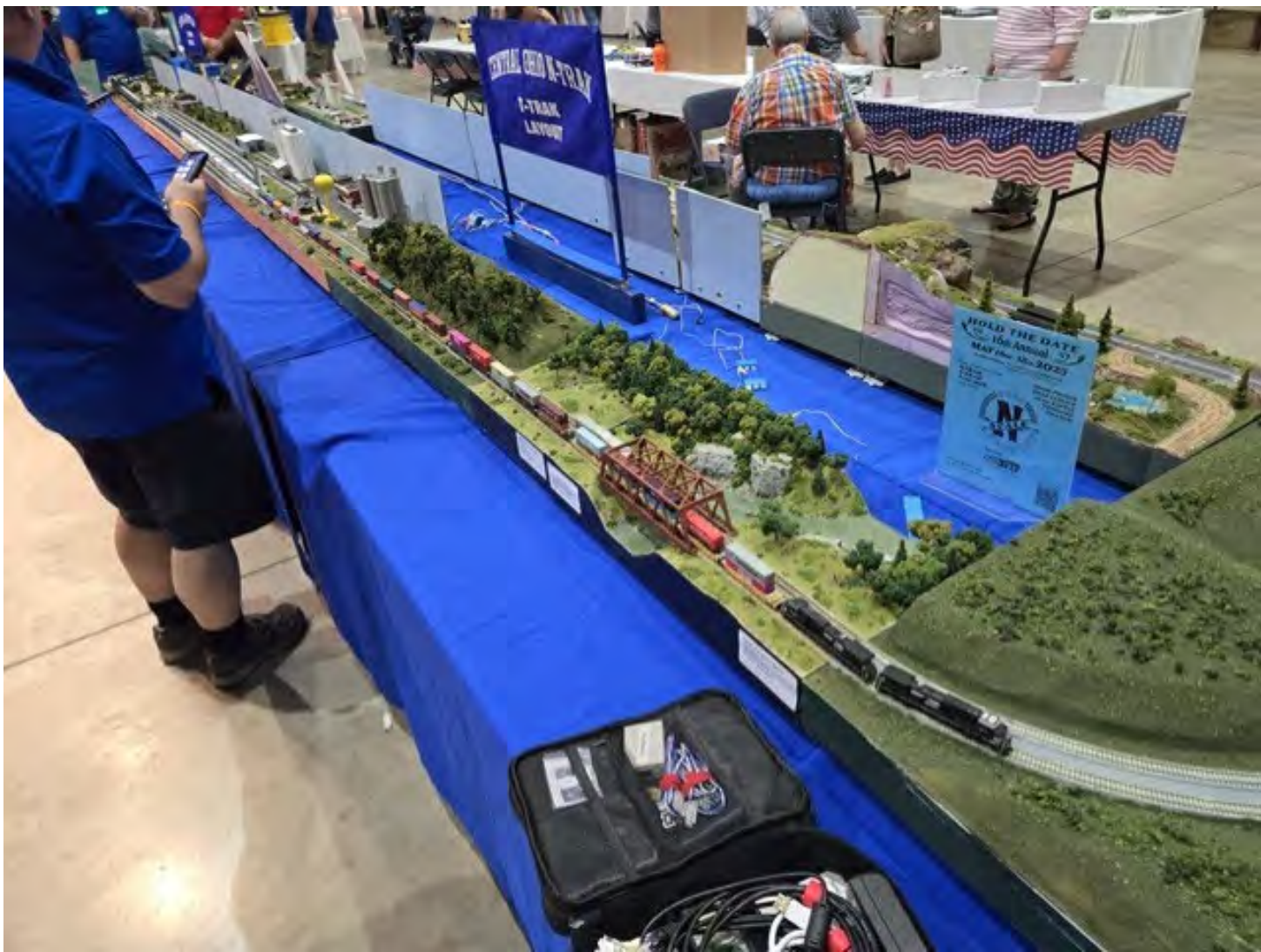
4. Central Ohio N-Trak T-Trak Layout