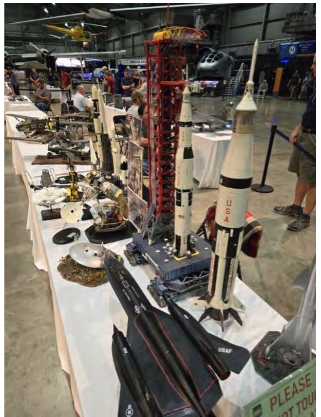
6. Lots of Winged Things