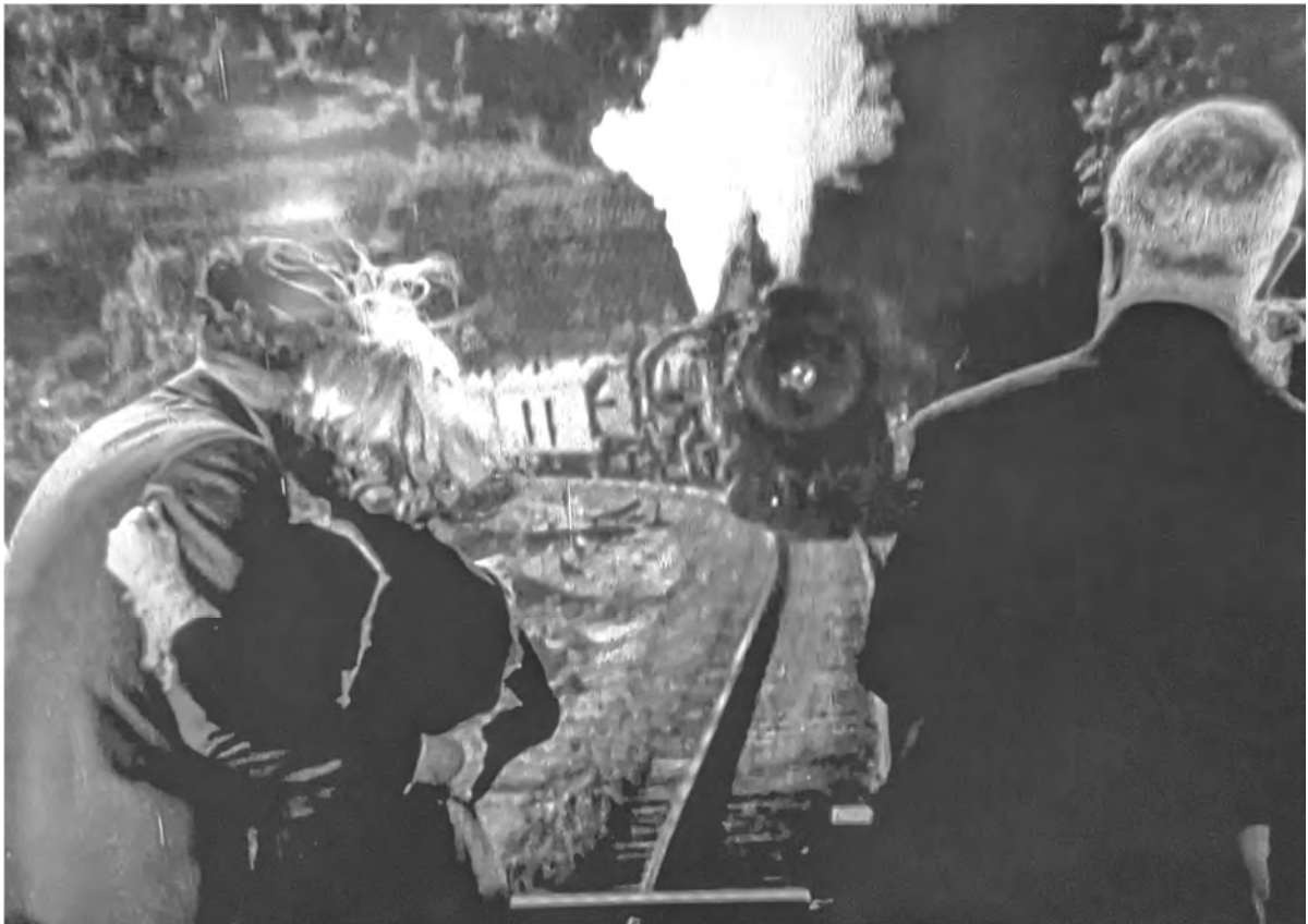
Good guys watch as run-away car chases the train downhill.