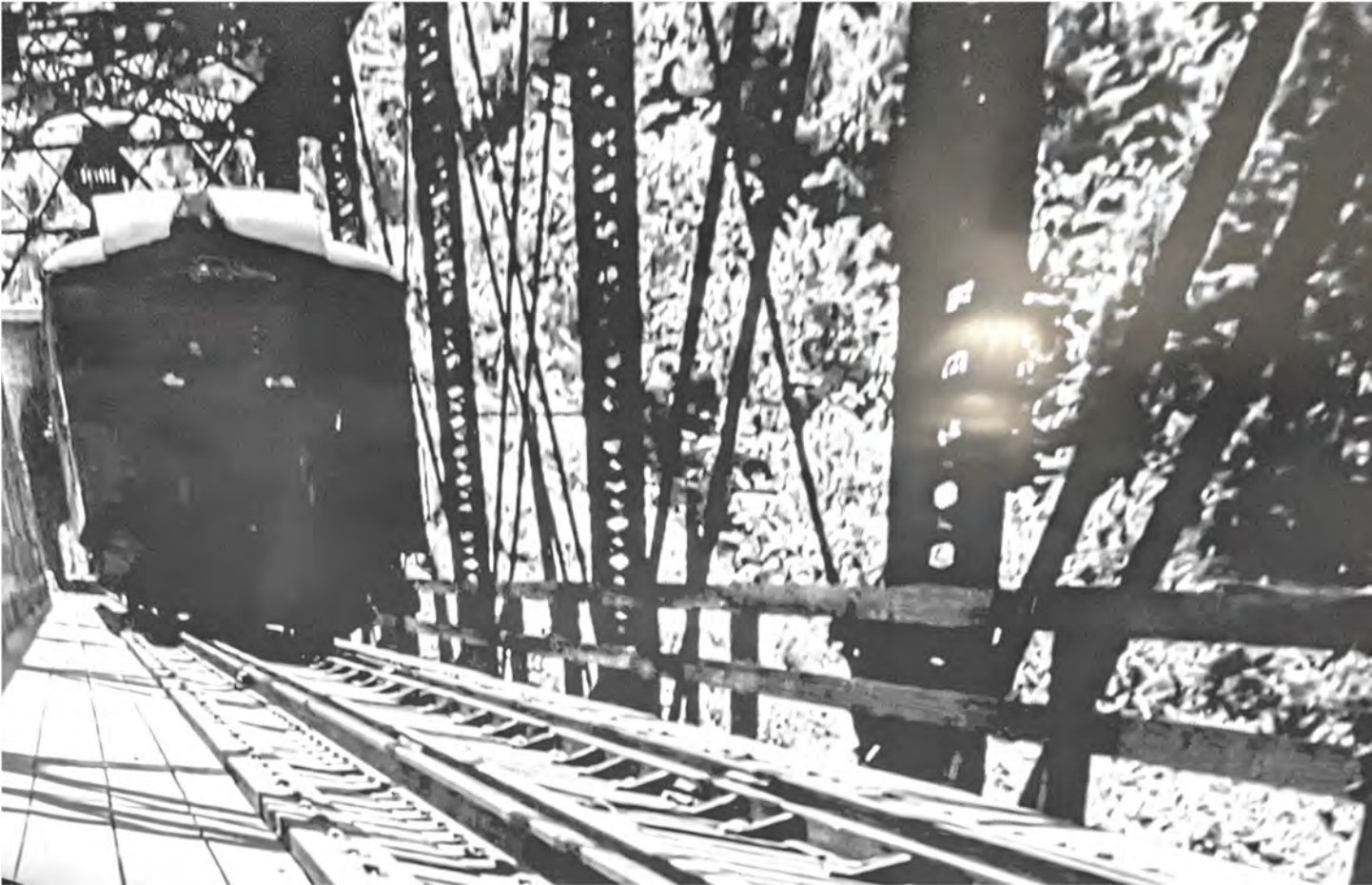
View of the private car on the guard rails of a bridge.