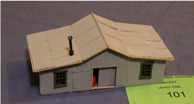
Third Place Kit — Ric Zimmerman