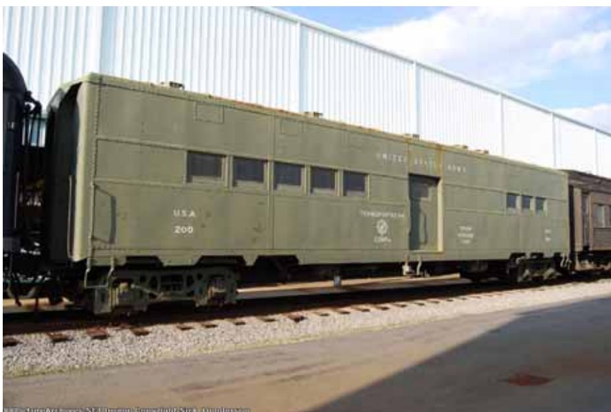
WW II Troop Kitchen Car