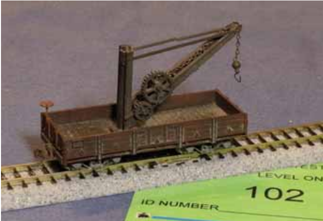
First Place - Kit