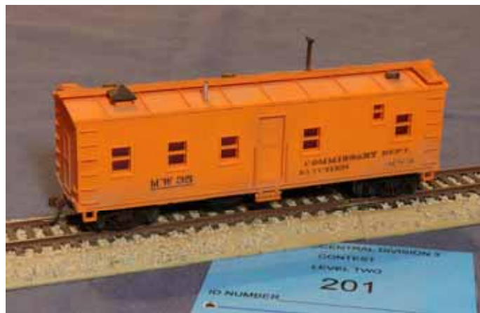
Third Place - Kit Bashed