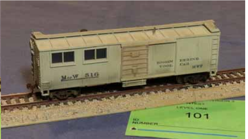
Second Place - Kit