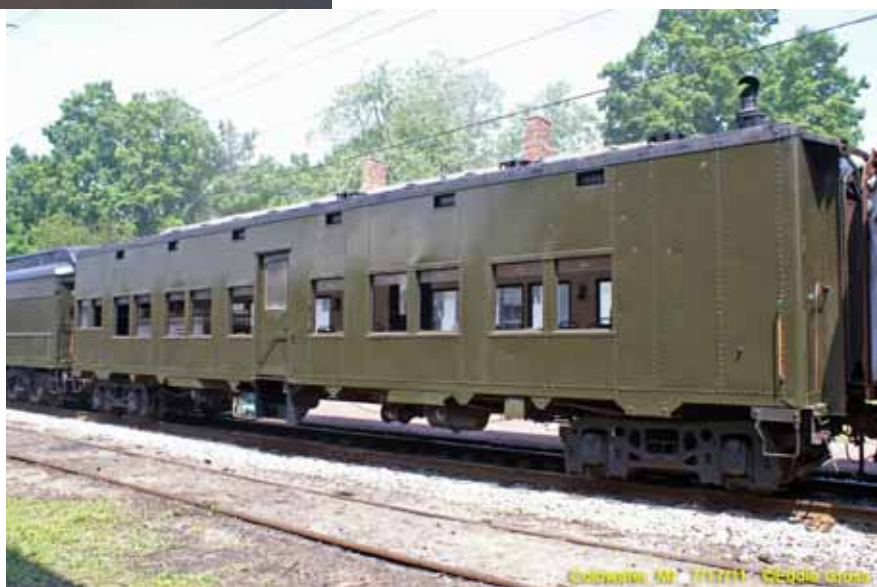
WW II Troop Sleeping Car