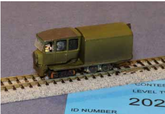
First Place - Kit Bashed