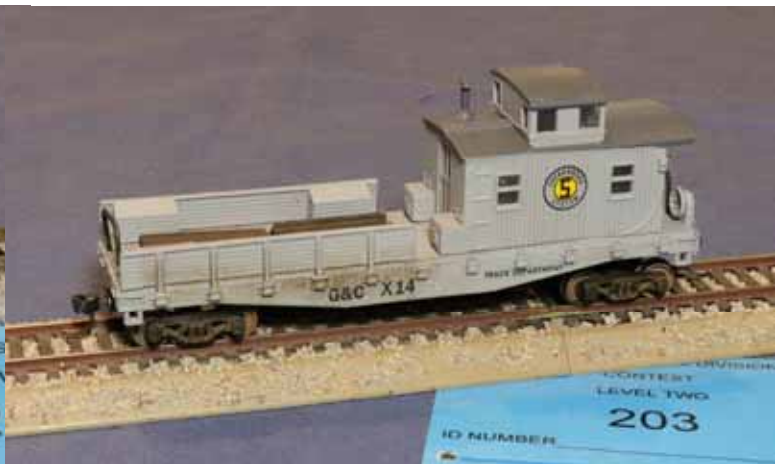
Second Place Kit Bashed