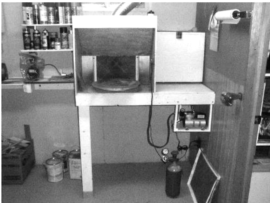
Here's my final setup. Old Gas bottle below, compressor on a shelf above and the filtered booth power exhausts through a window. Anybody need a neat 5 lb CO2 cylinder and regulator?

The upshot is that sometimes tools you've learned to live with can be improved. If you're new to the hobby, get advice and ideas, then begin to build your stock of tools. We can help you make choices if you ask but don't forget to stay open to ALTERNATIVES!