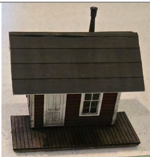
Second Place Kit — Jim Foster