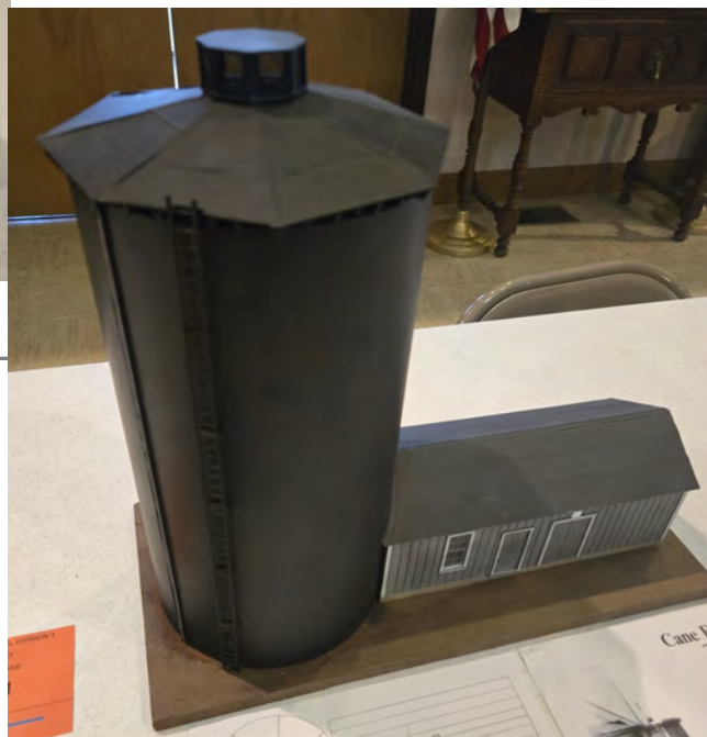
First Place Scratch — Bill Ford