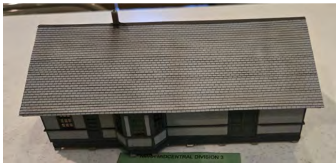
First Place Kit — Wil Davis