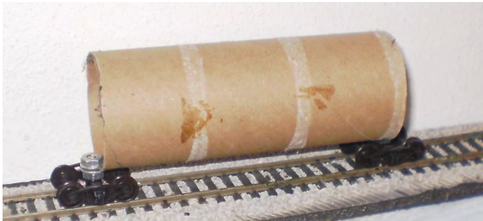
Recycling materials at North American Do-Ta-Do