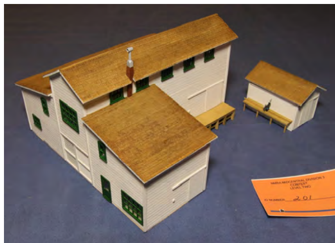
2nd Kit Bashed - Mark Stiver