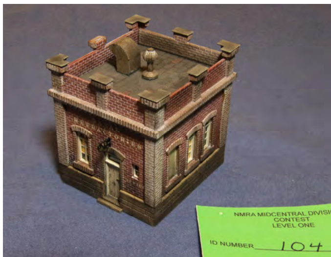
3rd Kit - Jim Foster