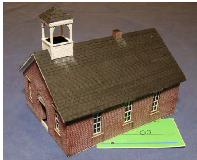
2nd Kit - Hans Schmellenkamp