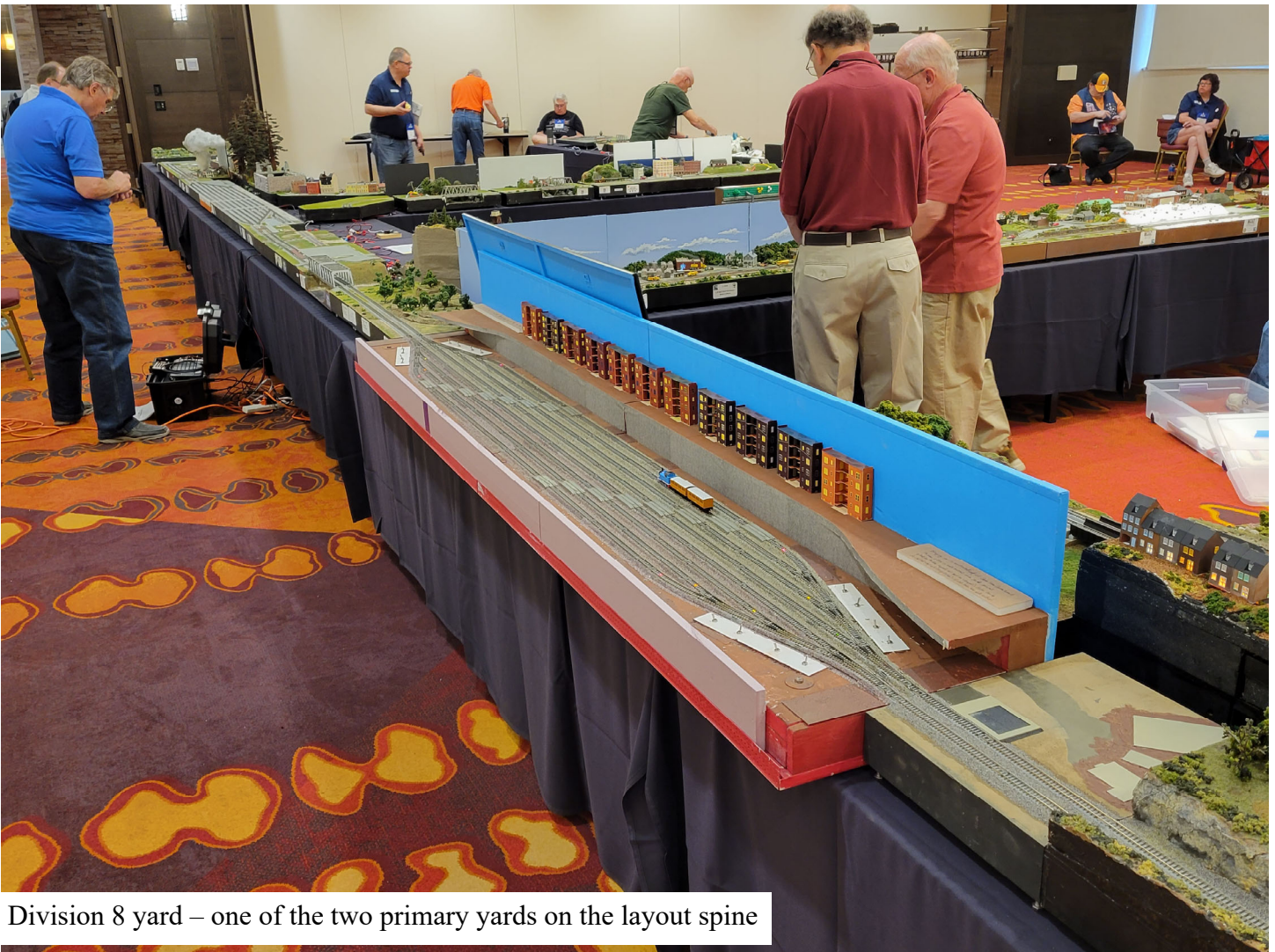
Division 8 yard – one of the two primary yards on the layout spine

The lead coordinator, Bruce DeMaeyer, arranged the layout to have a primary “spine” with two yard sections, with three “leg” extensions perpendicular to the primary run. To snap together nearly 100 modules in the space of 4 hours was enabled by three tenets: the height of the track connections over the table top, the standardized module lengths, and the KATO N-scale UniTrack connectors. Some of the layout modules were also featured in the earlier 2018 NMRA National Convention where a record-size T-TRAK layout was accomplished. Some of the more ambitious T-TRAK modules for the Indy Junction layout include a rotating tornado (set in a trailer park, of course) and a “Star Wars” museum set within a grove of redwood trees. The 2-foot trees on the module are to scale for the possible heights of live redwoods (300+ feet).