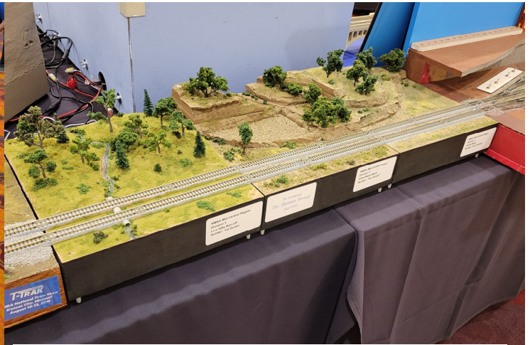
Division 3 Straights – the division’s straight modules were the mid-section of the layout spine, connecting on one end directly to Division 7’s yard.

The construction of T-TRAK modules will be among the features of Division 3’s TRAINING Day in August, at Carillon Historical Park. This presents an opportunity for additional division members (along with the public at large) to learn more of T-TRAK.