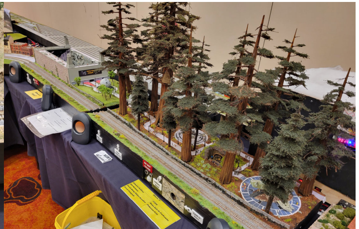
Star Wars Museum – the trees on this module, reaching up to two feet, are an accurate N-scale representation of redwoods