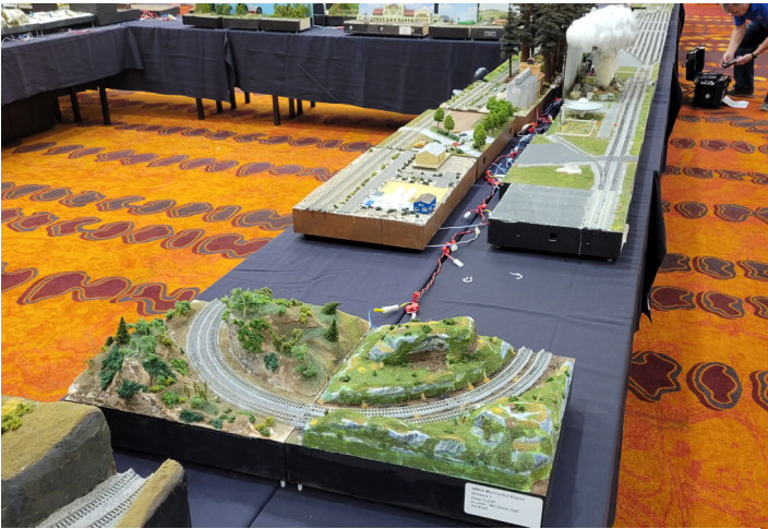
Division 3 Corners – two of the division’s corner modules formed one end of the layout’s “spine” section.