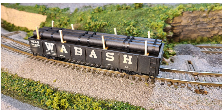
Scratch Built First Place Chris Stilson