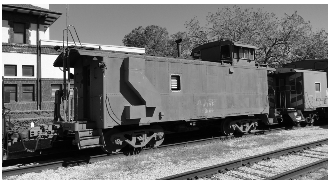
Second Place: Dana Yarnall