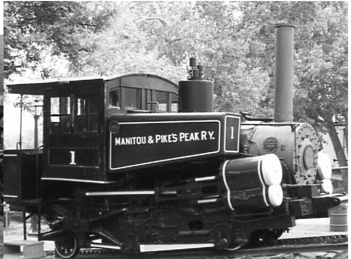
Some pictures from a family vacation in Colorado many years ago. Clockwise from upper left: Colorado Railroad Museum, Pikes Peak, Above West portal of Moffet Tunnel, Colorado Railroad Museum