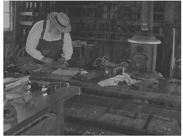
Skit Creek Paddle Company

The next spring flooding proved to be just as bad. The paddle equipped farmers were able to save more of their belongings than the unequipped. The paddle maker managed to do a good business until the hills recovered and the floods stopped. The farmers that still have paddles on their barns are ensuring that they will never be up Skit Creek without a paddle.