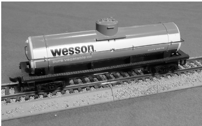
First Place - Level 1