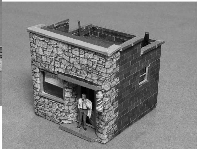
First Place - Level 2