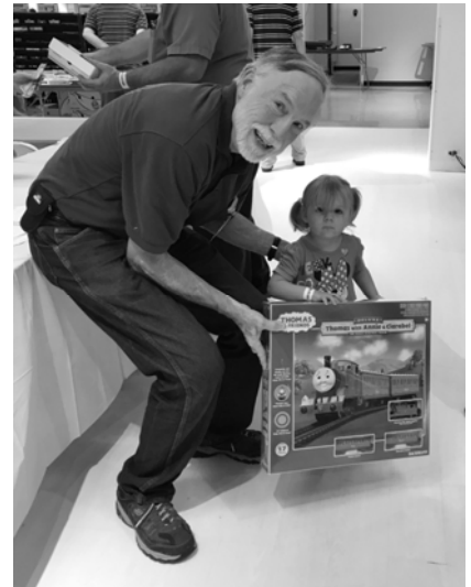
Thomas the Tank Engine Winner