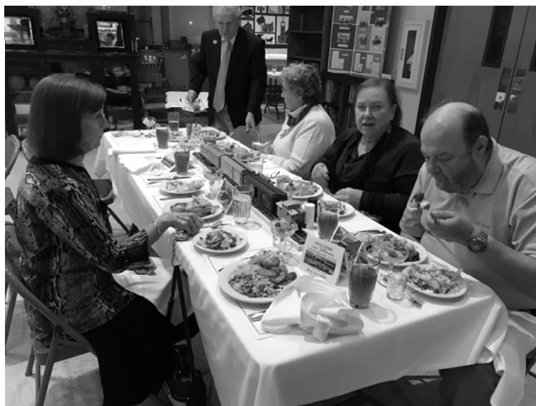
Dining by Rail at the Greene County Historical Society