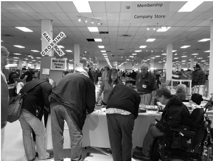
Ideal Venue for a Train Show

If you have any questions, feel free to contact the webmaster at webmaster@modelraildayton.com or at NMRA.div.3@gmail.com or call us at 937-301-0746. We will be happy to help you.