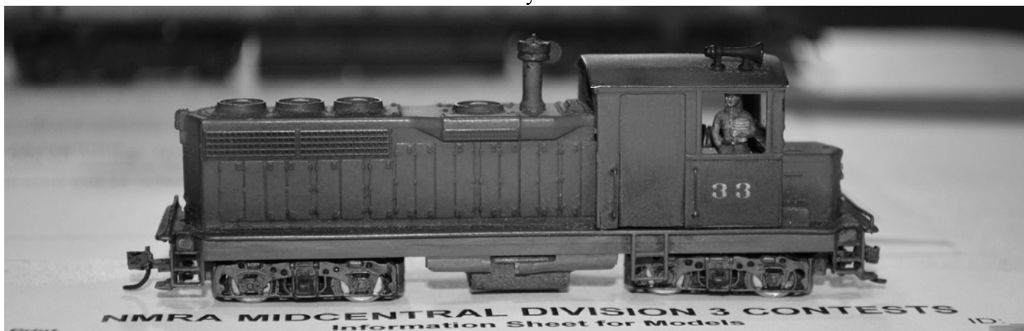
Level 2 First Place by Jim Foster