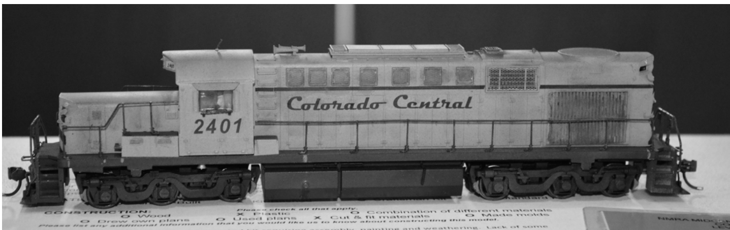
Level 2 First Place by Ric Zimmerman