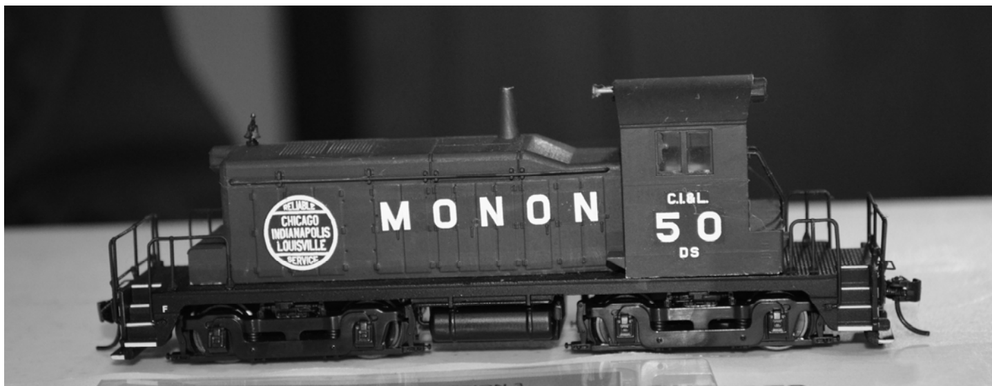
Level 1 First Place by Doug Campbell