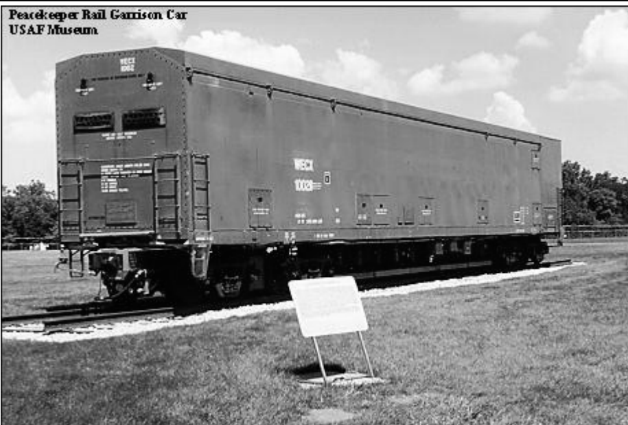
Peacemaker Rail Garrison Car USAF Museum

405 1/2 S. Broadway Greenville, Ohio (Second Floor)