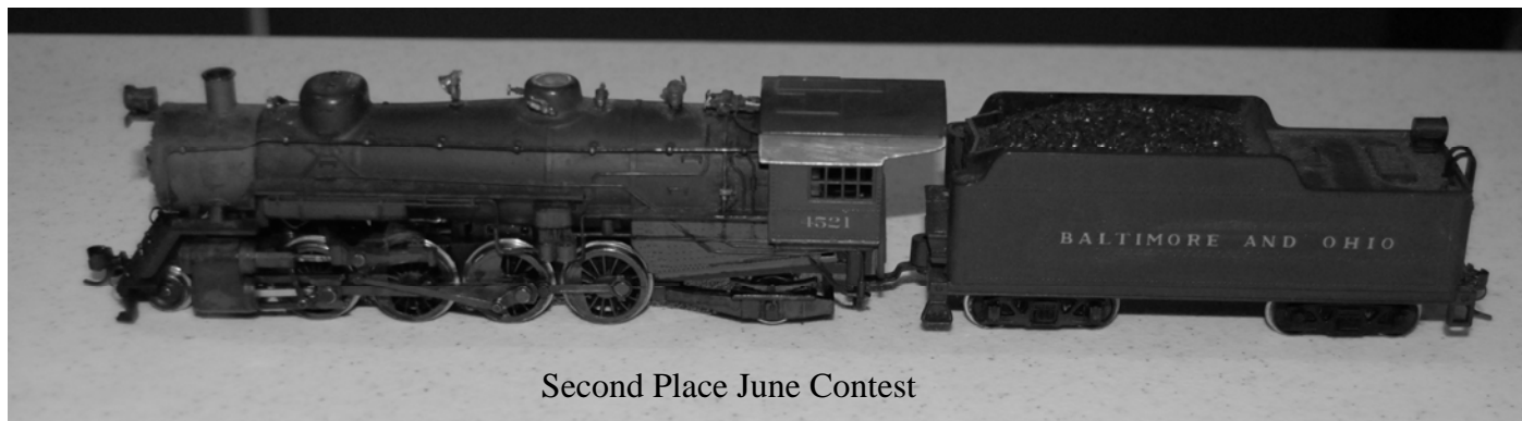
Second Place June Contest