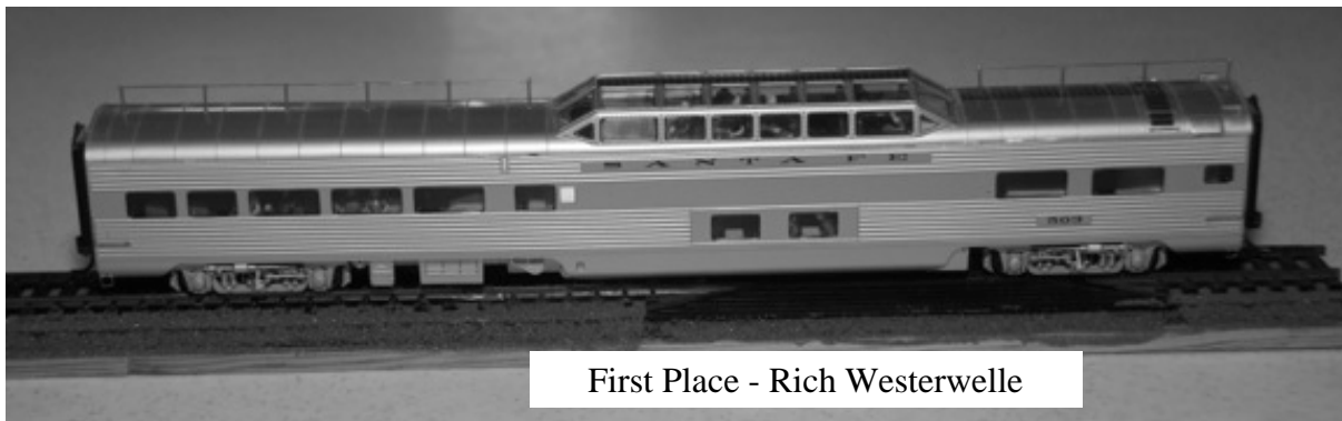
First Place - Rich Westerwelle