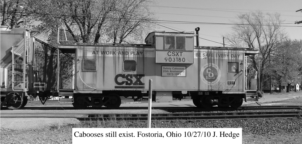
Caboose still exist. Fostoria, Ohio 10/27/10 J. Hedge