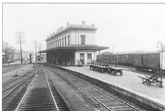
Highlights of "The Railroad Era" in Xenia, Ohio.